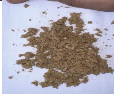
Figure 3. G. lucidum mushroom in powdered form obtained after grinding