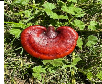
Figure 2. G. lucidum mushroom fruiting body

(Figure 2), the powder obtained was passed through a sieve with a mesh size of 0.87 mm [13].