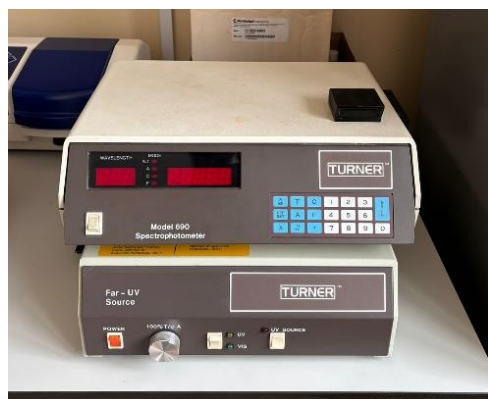
Figure 4. Spectrophotometer Turner 690

where, y - sample absorbance measured at 490 nm; x - carbohydrate concentration, R^2 = 0.9958 (correlation coefficient).