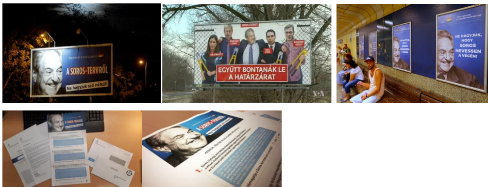
Figure 6: Phase 3 Hungarian government campaign against George Soros

Viktor Orbán continues his campaign series in phase 3 directly on George Soros. Orbán claims that Soros's plan is supported by Brussels, allowing a foreign international organization on settling one million migrants in Europe. Europe will become unrecognizable by a flood of Muslim refugees once Soros and his allies succeed in opening the borders. The Hungarian government amplifies this campaign against Soros by passing a 'stop Soros' law on June 2018, a purpose of this law is to strictly prohibit providing any kind of assistance to undocumented immigrants from individuals and organizations. This law means Hungarian government will have an extra power to jail its political opponents by accusing them for 'helping the refugees'. To conclude, "Stop Soros" law is a bill that human rights advocates fear will be used to shut down opposition groups and civil society.