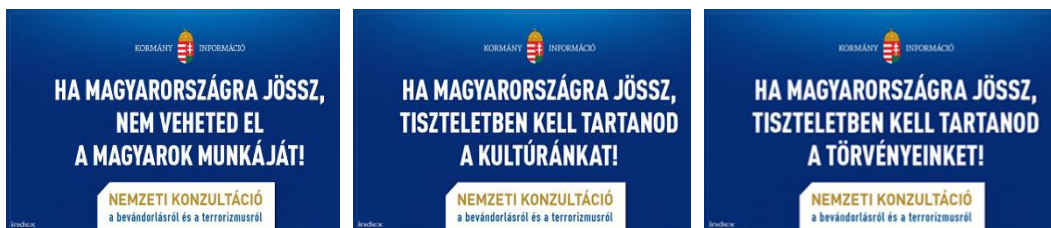
Figure 4: Phase 1 ‘If you come to Hungary’ billboard campaign against migrants and refugees by Hungarian government

1. If you come to Hungary, you cannot take away the work of the Hungarians!