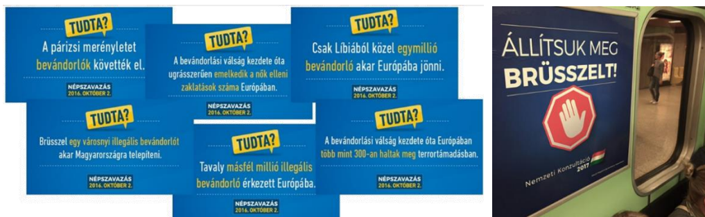
Figure 5: Phase 2 ‘Did you know?’ billboard campaign against migrants and refugees by Hungarian government