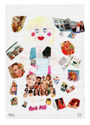
Fig. 4. The perfect teacher as imagined by the students of the 6^{th} grade of primary school.