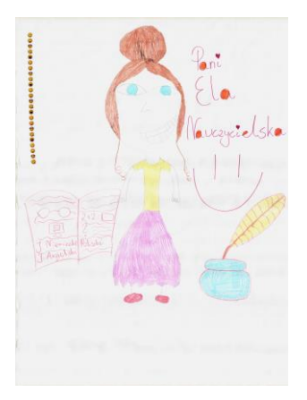
Fig. 5. The perfect teacher as imagined by the students of the 6^{th} grade of primary school. She has been called "Mrs. Elisabeth Teacher", and on the presented book there