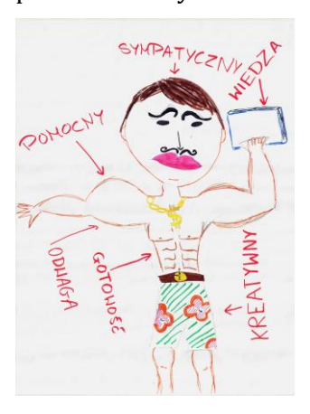
Fig. 7. The perfect teacher as imagined by the students of the 3<sup>rd</sup> grade of gymnasium. The traits written in the poster are: nice, knowledge, courage, helpful, readiness, creative.