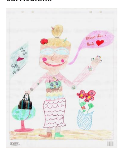
Fig. 1. The perfect teacher as imagined by the students of the 3^{\rm rd} grade of primary school. The teacher says: "I love children and teaching". Source: a poster made by students of a 3^{\rm rd} grade of primary school during the research

teacher is not only an individual, but also the relation with students and the curriculum.