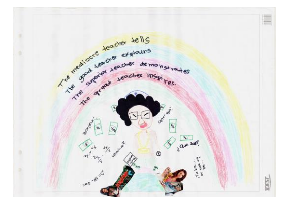
Fig. 9. Perfect teacher as imagined by the students of the 3^{rd} grade of lyceum.