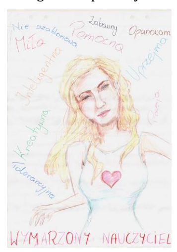
Fig. 6. The perfect teacher as imagined by the students of the 3<sup>rd</sup> grade of gymnasium. The title says: dream teacher, and the traits written in the poster are: thinks outside the box, helpful, funny, calm, nice, intelligent, creative, tolerant, passionate.

are some symbols and names of school subjects.