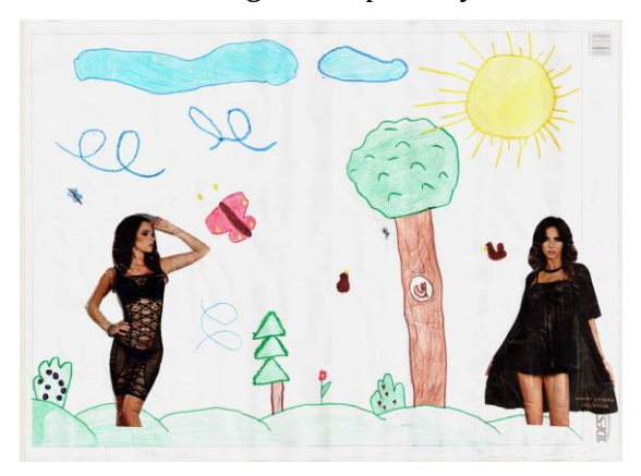
Fig. 2. The perfect teachers as imagined by the students of the 3<sup>rd</sup> grade of primary school.

When comparing students answers with the posters one can notice certain coherence, with the exception that in their answers the children did not focus on teachers' looks, they did not mention that this aspect was so important to them. However, without a doubt the importance attached to the appearance of teachers is clearly visible in the posters.