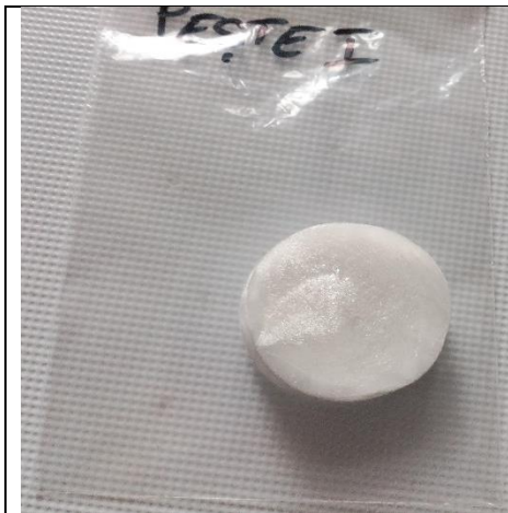
Fig.4 Extraction with 0.5 M acid acetic

Regarding the process of obtaining biomaterials from non-denaturated collagen (pastes and gels or collagen solutions) key-steps are represented by: restructuration, chemical alteration, compatibilization with various bioactive compounds and drying or conditioning as a finished product.[10]