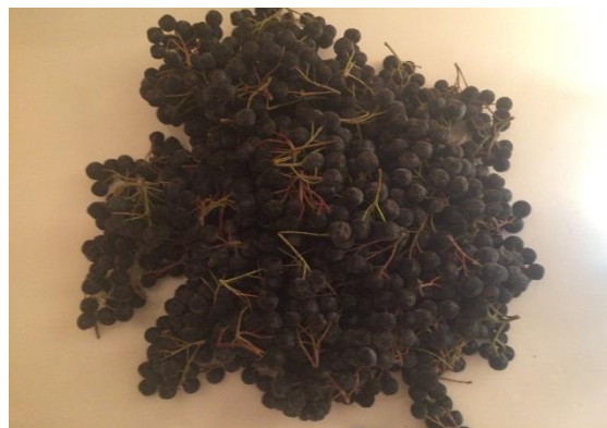
Fig.4. Aronia Melanocarpa Fruits from Dragasani - Vâlcea

Plant material: Mature Aronia Melanocarpa fruit samples (see Fig.4), approximately 1 kg each was collected from Dragasani Vâlcea in September 2016. The marketing conditions of these products were recreated in the laboratory by stocking them at 4°C.