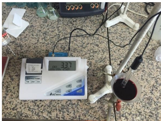
Fig. 5. pH - Aronia Melanocarpa juice (Day 3)

Vitamin C from fresh fruit and juice was determined using KIO_3 titration and pH of the juices was evaluated using a digital pH meter pH/mV Cond /TDS/Temp at 25°C (see Fig. 5).