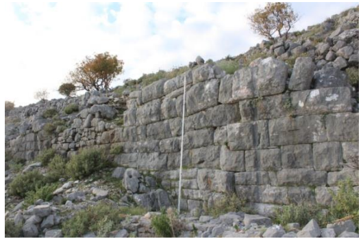
Fig. 2 The hill where Borshi is located (photo K. Çipa). Fig. 3 View of the south western wall (photo K. Çipa).

In the fortification there can be evidenced two construction techniques. One of the techniques is the one with trapezoidal blocks of the pseudo isodomic type, where, in some cases, the brackets used often break the rows. This technique was used to built south western, north western and acropolis' walls. Another technique used is that of the isodomic type, with rectangular blocks of regular rows and equal height. This technique is found to have been applied at the south eastern tower and at a part of the wall extending to the west of the tower. The technique of pseudo isodomic trapezoidal blocks in the territory of South Illyria and Epirus dates back to the IV-III century B. C. The tower and wall of isodomic technique should be a later construction of the III Century B. C.