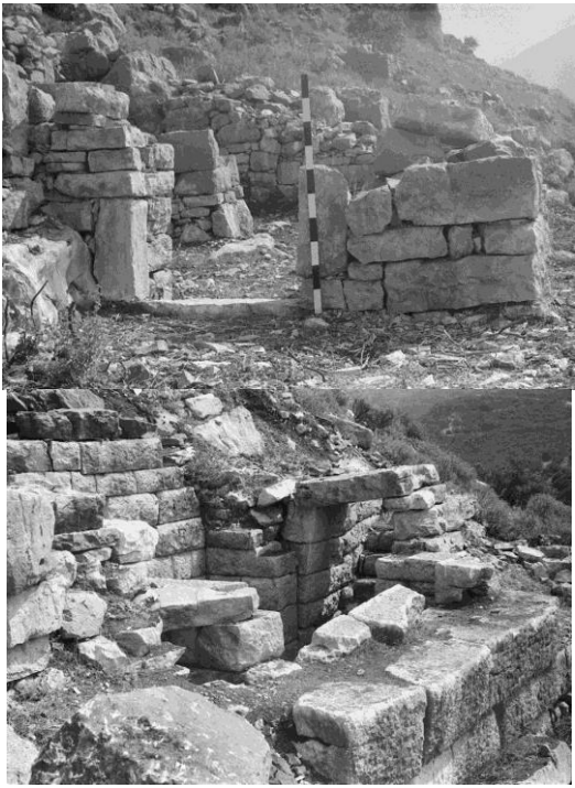
Fig. 4 View of an ancient dwelling in Borsh (J. Koçi 1986). Fig.5 View of the Monumental Tomb ( J. Koçi 1986)