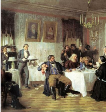
Juravlev, Merchant funeral dinner, Oil in canvas, 98X 142 cm, 1876, Tretyakov Gallery, Moscow, Russia