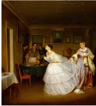
Fedetov, Major's wedding proposal, Oil in canvas, 58,3X75,4,1848, Tretyakov Gallery, Moscow, Russia