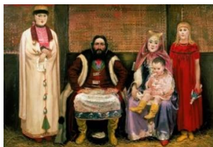
Ryabushkin, Merchant family in 17th century ( Sem'ya kuptsa v XVII veke ), Oil on canvas, 143 x 213 cm, 1896, Russkiy Museum, Saint Petersburg, Russia