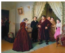
V.G.Perov, The arrival of a governess in a merchant's house birthday party, Oil in Canvas, 44x53.5 cm., 1866, Russian Museum, Saint Peterburg, Russia