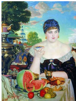
Kustodiev, Merchant's wife, Oil in canvas, 120,5x121,2, 1918, Russian Museum, Saint Petersburg, Russia