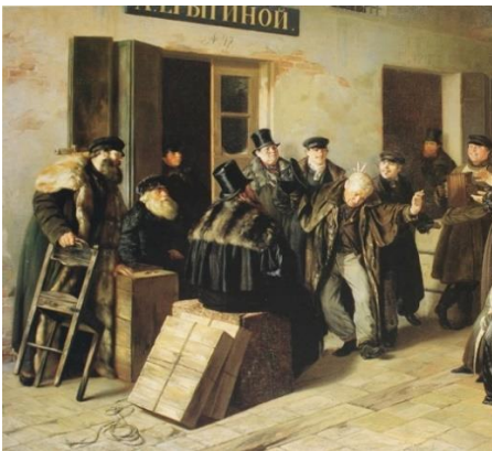
Pryanishnikov "Jokers. Merchant court in Moscow", Oil in Canvas, 63,4 X 87,5, 1865 , Tretyakov Gallery, Moscow, Russia