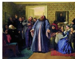
Nevrev, Protodeacon proclaiming longevity at the merchant, Oil in Canvas, 60,4 X 73 cm, 1866, Tretyakov Gallery, Moscow, Russia