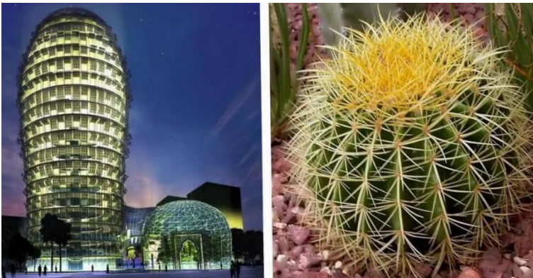
Figure 2. Qatar Cactus project. (Maglic, 2014)

While the dome of the exhibition building was designed in Montreal, it was inspired by the diatom of aquatic microscopic creatures. When the diatom is examined, it is seen that the cage system consisting of triangles, pentagons and hexagons is fully fitted to each other and allows maximum clearance to be exceeded while providing minimum material usage to form the shape. The diatom form has been a model for the roof and ceiling designs for Buckminster Fuller (Ball,1999).