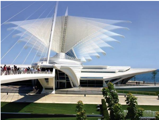
Figure 3. Milwaukee Art Museum by Santiago Calatrava (Calatrava's Rising Pavilion, 2010)

Energy quality and efficiency have been considered in the MMAA building, which is called the cactus project, and designs have been made according to this idea. The blinds in front of the windows are designed as a collapsible system to adapt to variable temperatures (thus, we would not be able to hold water, but mimic the activity of the cactus that sweats at night instead of during the day). The dome, green area and garden at the base of the tower will be located and the wastewater can be cleaned in the botanical garden inside (Spray, 2019).