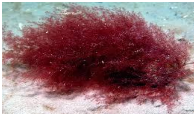
Figure 1. Red algae in the algal colony