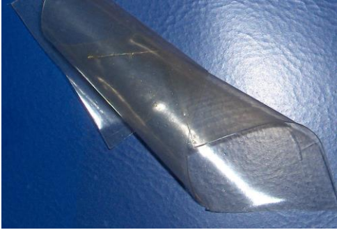
Fig. 3. Collagen membrane

Composite collagen membranes can contain the same class of compounds used for obtaining of composite matrices. However, there is a restriction in what regards the percentage of added components. This depends on the nature of the compound and its solubility and reactivity towards the collagen gel. In composite membranes formed by powders of ceramic, hydroxyapatite, TiO 2 , SiO 2 aerogels, modified natural silicates, cannot represent more than 5-10% of these compounds. The formation of composite collagen membranes from natural polymers or water soluble vegetable composites is more significantly influenced by intermolecular interactions which can lead to the co-precipitation of components [1]. Amongst collagen membrane-based bioproducts, the most important are related to: