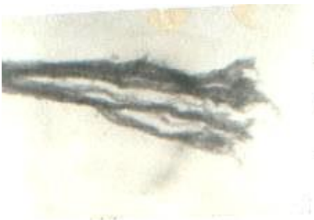
Fig. 1 Non-tanned collagen fibre formaldehyde

Using the electronic microscope, subunits of the fibre, more specifically collagen fibrils can be obtained. Collagen fibres precipitated from a 0.2% collagen solution were studied under the TEM electronic microscope with double contrasting with phosphowolframic acid and uranyl acetate. Collagen fibrils are long, dense, and relatively even in regards to width and they form knot-like clusters. Also, it can be observed on certain portions of the photo, that there is a tendency for fibres to wrap in a helicoidal manner. Fibres are elastic, which allows them to curve under different shapes, the most frequent one being represented by the semicircle shape.