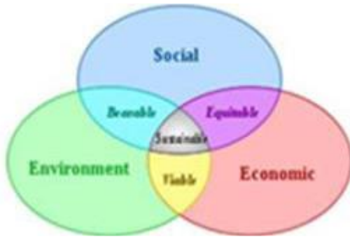
Fig. 3, Three overlapping circles model

Other authors (Lehtonen, 2004) think that the three pillars of sustainability are not equal, but have different positions in a hierarchy. In line with this some authors propose a more complex and profound model, such as the "egg" or Prism model.