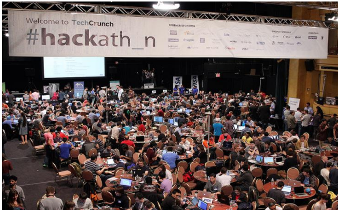
Shape (1) photography of techcrunch hackathon