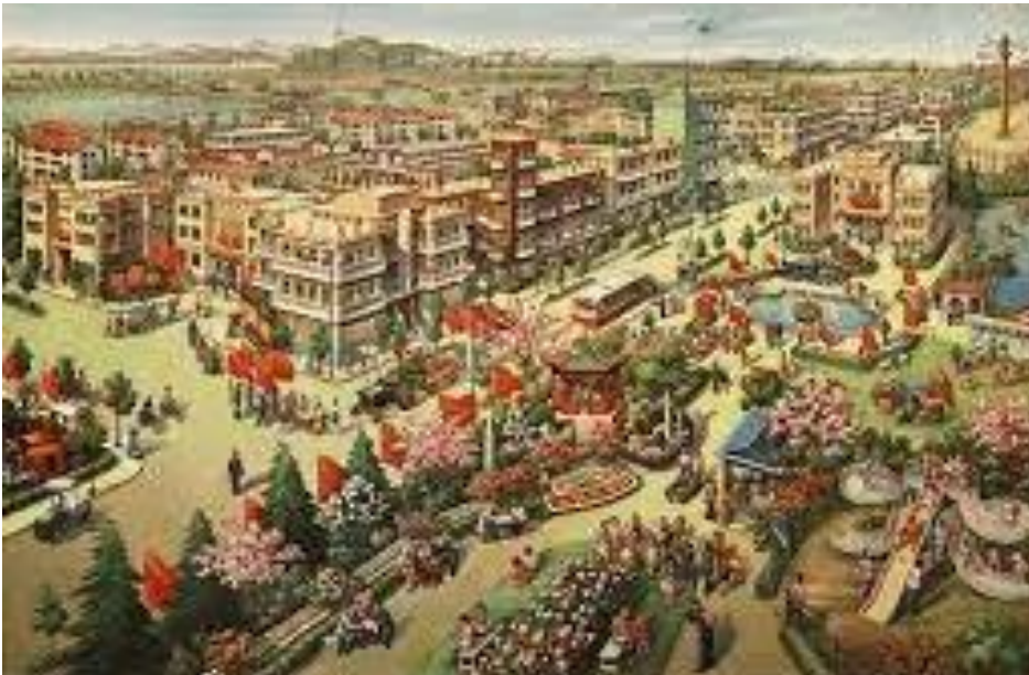
Shape (4) the Chinese communes illustration drawings

Third: The Products of the post-production stage of Chinese animation