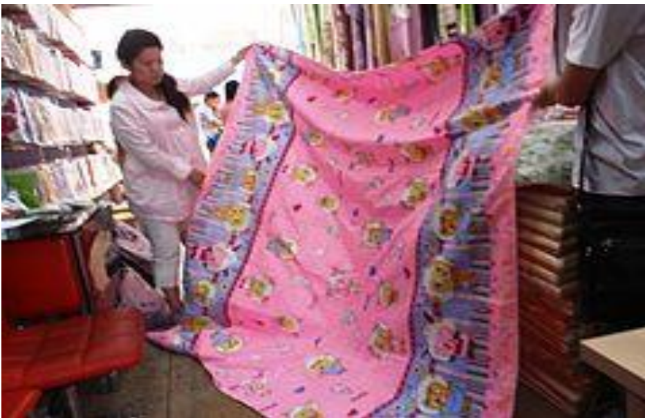
Shape (5) Products of the post-production stage of the movie The Goat and the Great Witch

Third: The Products of the post-production stage of Chinese animation