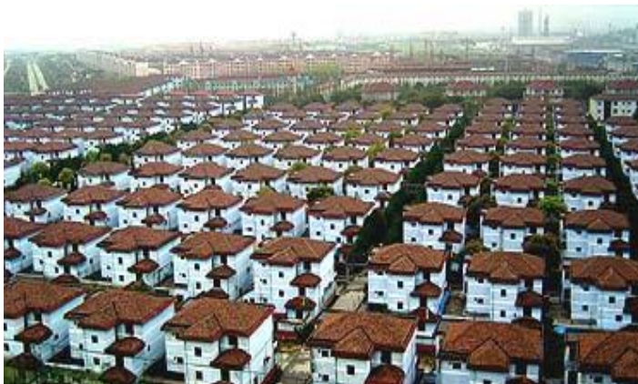
Shape (3) the Chinese communes illustration drawings