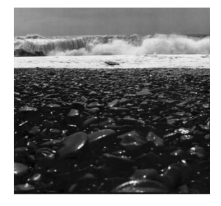
Figure-4: Per "Ossi di Seppia", Monterosso, 1962.

"Verifications (1968-1972)" that is the last photography series of Ugo Mulas, before his death, is completely based on the use of intertextual transactions in photography. Mulas has tried to draw attention to the importance of masters in the history