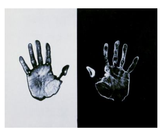
Figure-6: The Laboratory, A Hand Develops, The Other Prints To Sir John Frederick William Herschel.

In laboratory verification (see Figure-6), the development and fixing chemical steps, that the camera is not included in the dark room, are emphasized. Mulas was devoted this work to the famous chemist Herschel, highlights that everything is done by hand in the laboratory. The paper is taken out, the paper is placed under the enlarger, the focusing is done, enlarger is lifted and lowered, the paper is taken again, the paper is put into the paper developing chemical, washed, reinserted and placed in the fixing bath. In this work, the hands are the main character of the story, and the only subject is a pair of photographs. Artist; He put and pressed his hands on the photographic paper under the enlarger and to divide the paper to pairs two parts.