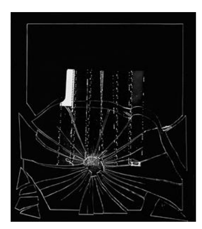
Figure-8: End of the Verification. To Marcel Duchamp.

Mulas preferred to finish his series with the first work of this series (see Figure-8). In this work, the artist used the glass item as the different from the first work of-this series. Glass has added a new character to this composition physically and visually. Alongside broken glass associated with brings to mind the works of Duchamp (like Large Glass), it is significant that this fracturing process can never be repeated in the same way.