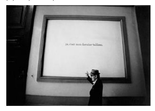
Figure-7: Caption To Man Ray.

In laboratory verification (see Figure-6), the development and fixing chemical steps, that the camera is not included in the dark room, are emphasized. Mulas was devoted this work to the famous chemist Herschel, highlights that everything is done by hand in the laboratory. The paper is taken out, the paper is placed under the enlarger, the focusing is done, enlarger is lifted and lowered, the paper is taken again, the paper is put into the paper developing chemical, washed, reinserted and placed in the fixing bath. In this work, the hands are the main character of the story, and the only subject is a pair of photographs. Artist; He put and pressed his hands on the photographic paper under the enlarger and to divide the paper to pairs two parts.