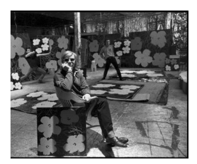
Figure-1: Marcel Duchamp, 1965.