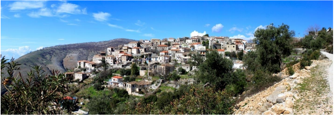
Fig. 3 Village of Upper Qeparo.

Sustainable tourism categories should be introduced to the Albanian culture, not only because of the long-term economic gain and inclusion of SME – small and medium-size enterprises, but also for the proper use of its natural, cultural and historical potentials in branding Albania in a better and more sustainable way. The European commission has been fostering the concept of cultural tourism since 1987, encouraging methods that have impacted many countries in terms of creating better sustainable tourism in Europe. There are many countries that have fully embraced it but the southeastern part of the Balkans is still falling behind in creating sustainable tourism and branding cultural tourism / routes. (UNTWO, Sustainable Tourism for Development, Enhancing capacities for Sustainable Tourism for development in developing countries 2013) Cultural tourism / routes can be the perfect solution for preventing the continued uncontrolled development in the Albanian Riviera, noting cultural/natural heritage as the main actors in fostering solutions regarding the area's alternative tourism.