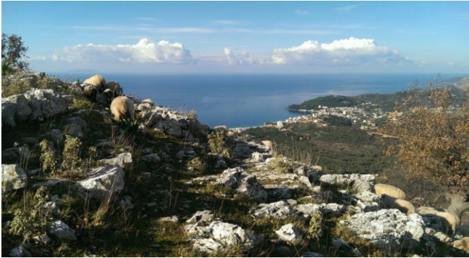
Fig. 1 Albanian Riviera Landscape, Himara.

Due to Albania's long isolation and the urge of its inhabitants to migrate after the '90s, there was a tendency to leave the villages located along the abandoned coast for either Greece or Italy. Yet, for the past 10 years and still continuing, many immigrants are coming back due to the economic crisis affecting Europe, investing their capital earned abroad in either building hotels or estates, without firstly evaluating the current state of the place and surroundings. This neglect directly affects the cultural and natural heritage of the historic villages by destroying the picturesque scene and polluting it.