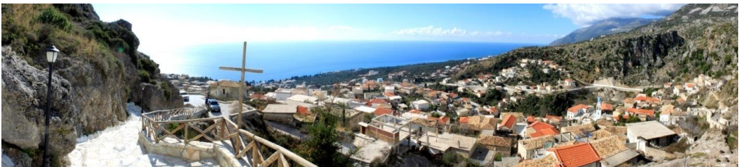
Fig. 2 Village of Dhermi.

It is essential to emphasize that tourism in the Albanian Riviera, aside from all the natural diversity offered, is greatly focused on beach retreats during the summer season from June - August with no other options for the rest of the year. While beaches can be fully packed during summer season, there is plenty of space and peace during low season. Sadly, the issues of the past decade's poorly planned development have ruined many once-charming coastal villages. This trend is still directly fostered by local management issues such as poor road and public utilities infrastructure, unregulated waste disposal, illegal construction etc.