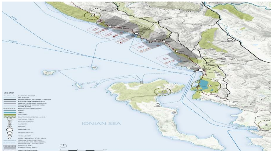
Fig. 4 Segmentation of Tourism potential targets.

In the case study of the Albanian Riviera, the research focused on promoting the cultural tourism of the area through different interventions would have a positive effect through the fostering of economic growth of the southern Mediterranean villages. The entire Riviera was segmented in five main potential tourism targets, such as Cultural Tourism; Alternative Tourism; City Tourism; Family Tourism, and Eco Tourism, in the effort of reactivating the whole area.