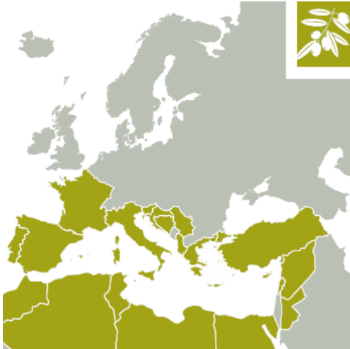
Fig 7. Countries involved in The Routes of the Olive Tree Programme.

Messenia (Greece) comprising a wide range of institutions, organizations, universities and Chambers of Commerce in Mediterranean and European countries. This can be referred as the perfect example in how to managing cultural roots and its main actors for the Albanian Riviera. (Council of Europe, The Routes of the Olive Tree 2014)