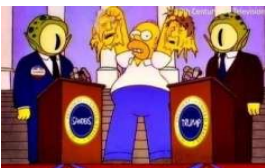
Figure No. (9) shows several cadre from the Simpsons series

The sixth axis :Expressing about American presidential elections in animation film as a political motivate