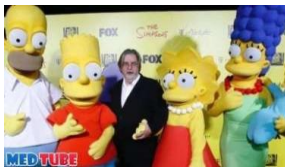
Figure No. (2) illustrates the image "Matt Groening With puppets of cartoon Simpson character,"

As for the Simpson family, ""The Simpsons" called in the Arabic version ""Omer Shamshons", "The character of "Simpson Jay Homer" and famed by "Homer" is a fake character and the hero of the animation series of the Simpson family, the series subject that Homer family-with the strange yellow to attract attention- consists of Homer, the father and his wife "Marge", and three kids: Bart & Lisa & Maggie. He was working in The nuclear power station "Serenfield" and Homer embodies the American moderate class. acting his voice: "Dan Castellaneta". For the first time on television, he appears with the rest of his family, in a short film entitled "Happy night" on April 19, 1987, the character of "Homer" is designed by Painsit, "Matt Groening" while he is waiting in James L. Brooks' office hall "After its appearance for three seasons on Tracey Ullman channel, then Fox channels network get the right of publication this series to that chain and presented its first episode on 17 December 1989. Fox company has owned the official sponsor of "The Simpsons" series until year 2022.