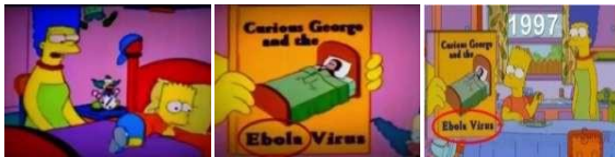
Figure No. (5) illustrates several cadres from the Simpsons series

The Simpsons series predict with Ebola virus. in the 1997 an episode displayed about Ebola virus without having a relationship with the story of the episode, where the mother is introduced a book for her patient's son carrying his cover the phrase" Virus Ebola "and shows a sleeper monkey. It knows that the monkeys pointed out the accusing fingers for a long time therefore being carried by the virus and the origin of its spread. When the series team workers were asked about this, their response was that the disease was known since 1976 and renewed its appearance in 2014. It was almost becoming a globally disease but it remained in West Africa.