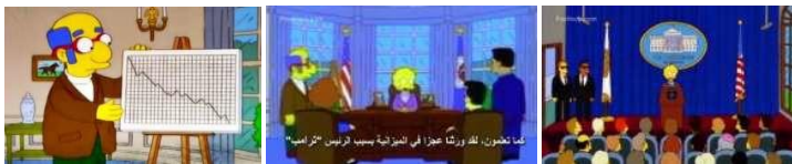
Figure No. (6) explains several cadres from one of the Simpsons episodes

In the rest of the episode, "Bart" is a failed music, while his sister Lisa was the first president of the United States - nodes here to Hillary Clinton - after the President Trump, who left the country in a bad financial position.as liza's dialogue : "We inherited a critical situation." When Lisa asked, her secretary – the president's Secretary of the United States - " Fan Hoten" for the financial situation, and he answered her : "we are bankrupt".