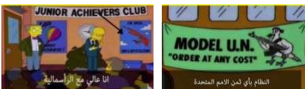
Figure No. (12) explains several cadres from the Simpsons series

Also in Hollywood movies, which merged the reality into the computer graphic and optical illusion as in the " Terminator part II", "Judgment Day", in 1991 so some videos came online and on YouTube thought that the series team workers may be Illuminati. As The series "Simpsons" on the 20th century Fox television mention some political phrases as a United Nations debate, "system with any pay "I am high with capitalism".