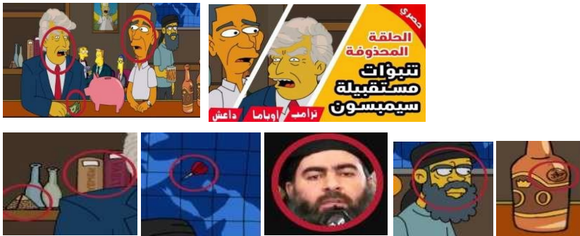
Figure 13 illustrates one of the scenes expressed a lot of hidden messages from a piggy bank - symbolizes that America may need in the future for China support- to the rest of the items in the background

In the special episode, which was displayed between 2004: 2008, "Trump" appears accompanied by a man from African assets called "Tommy". Tommy- which is similar to the Park Obama- speaks so afraid of something with Donald Trump. While Trump gives him two pieces of money category $ 100, who is irritatingly and tremblingly in a scene that does not exceed 10 seconds .