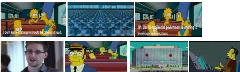
Figure No. (11) explains several cadres of the Simpsons series, at the top cadres illustrate the dialogue that the USA government monitors the telephone talks of her citizens, and below the cadres illustrate by the employee who was working on the USA National Security Agency and explains this fact

The scene of the Simpsons series in 2007 "Liza and Marg" was hiding afraid of the government tring to save their city from destroying. So liza is trying to warn her relatives about their conversations, because the government is spying on their conversation and it is not away that this spy is included all citizens.