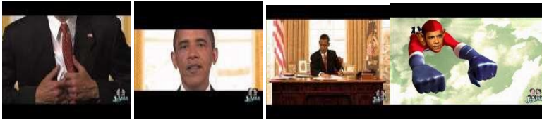
Figure No. (14) explains several cadres from Video clip entitled The Video clip lyric entitled "He's Barack Obama .. He's Come to Save the Day".

Barack Obama is the supernatural Hero as Super Man, which will achieve the impossible for America at the internal and external level in its international relations and the video clip shows the supernatural capabilities of Barack Obama.