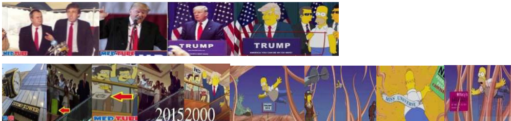
Figure No. (3) explains several cadres from one of the Simpson Family episodes in 2000 predicted that Trump becomes the president and conformed with the scene in the contemporary reality after several years when Trump was already nominated to preside the United States of America In the late 1980s, Trump was recently nominated in 2016 and the usual tray scene in the Trump Tower, and finally after he become the President of the United States and the fears about his shocking statements.

Where the father "Homer" goes to the future to find the conference "Donald Trump" and he is presenting to the USA president in the press. After The country will lose her mind . As America will fall down in the rest of the rich trump family , which control America and the the world too. There is a little who remembered this laughing and reliable episode that remembered by Sky News and broadcasted the comic episode that was given to the episode writer, a great fame since the date of Donald Trump won the presidency.