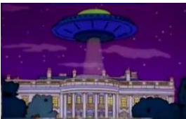
Figure No. (8) illustrates several cadre from the Simpsons series

The sixth axis :Expressing about American presidential elections in animation film as a political motivate