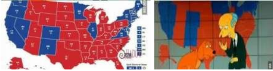
Figure No. (7) illustrates a cadre from one of the Simpsons episodes

And the absent reality of everyone that Trump has expressed its political ambition to reach the USA presidential chair in 1987, after one year the appearance of the first episodes of the series " The Simpsons", and announced his candidacy since October 1999, to enter the USA presidential race for the first time in 2000. Candidated by A small American reform party. Some political analysts surprised his shares by winning Trump the USA presidency, nominated by the Republic party. As he appeared in The Simpsons series since 17 years in the 84-year-old in 2033, and he has brought to America a Sufficient crisis and broken finances in external debt and in the dependency of Europe, China and their subsidies. Grape. This scenario comes in contrast to the trump election campaign in which he is promised a maximum economic residence and restoration of America.