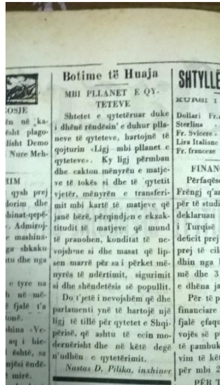
Figure 3. Article of Eng. N. Pilika in the press of tim