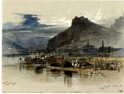
Fig. 10. Edward Lear, "Castle of Berati", - 1848.