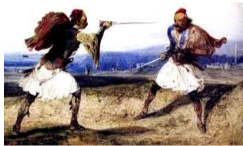
Fig. 3. and 4. Alexandre-Gabriel Decamp, "Albanian dancers "and "Albanian Fight", works accomplished circa the 1830's.