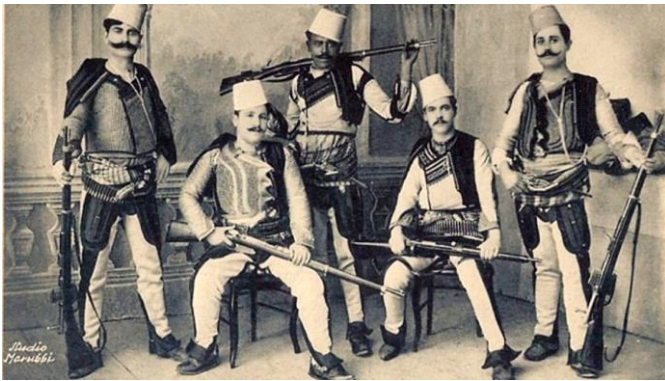
Fig. 18. Photo "Marubi" Studio, circa 1900's