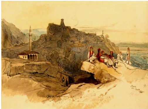
Fig. 9. Edward Lear, "Castle of Kruja", - 1848