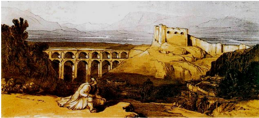
Fig. 15. Edward Lear, “Aquaduct and Castle of Gjirokastra”, - 1848