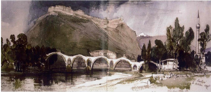
Fig. 14. Edward Lear, “Shkodra (Scutari) in northern Albania, with a view of the fortress and the old Bahçellëk (Gardens) Bridge (1768-1880) over the Drin River, 4 October 1848.