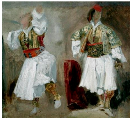
Fig. 5 and 6. Delacroix art works created circa 1830's, for an Albanian knight figure dressed in fustanella and for an Albanian folk dancer