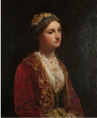
Fig. 1. Jean Baptiste Vanmour, "An Albania woman".