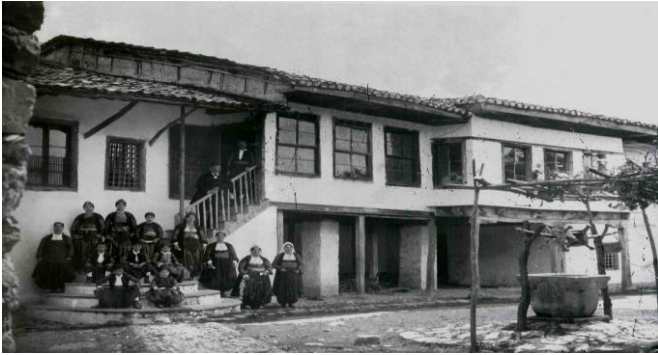
Fig.17. Photo "Marubi" Studio, circa 1900's."