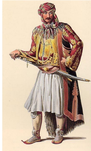
Fig. 7. Illustrations of contemporary clothing where many elements are borrowed from Albanian clothing, especially fustanella