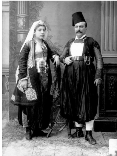
Fig. 19. "Highland Couple from the North Area" and Fig. 20. "A couple of citizens from Shkodra".