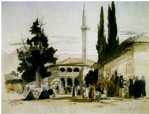
Fig. 11. Edward Lear, "Tirana", - 1848