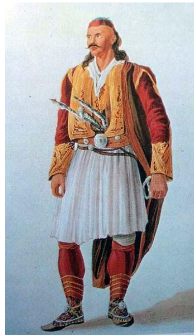
Fig. 8. Portrait of "Ali Pasha" and "Soldier dressed with fustanella" painted by J. Cartwright circa the 1810-20's