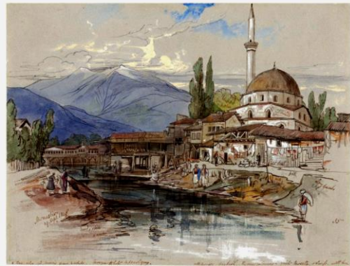
Fig. 12. Edward Lear, "Ohri", - 1848