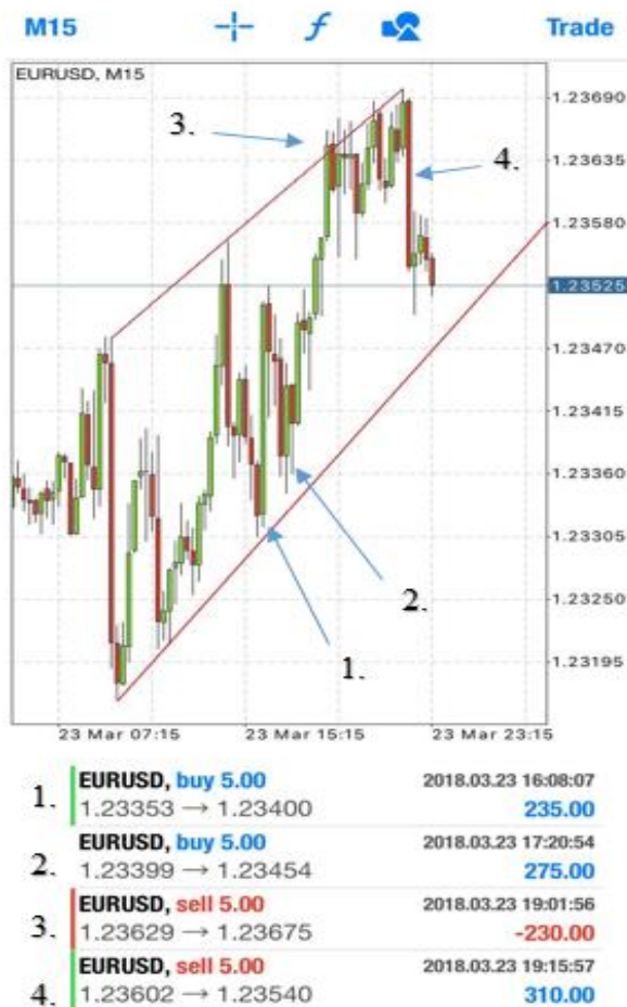
Picture 5 Trade no. 4

which was set immediately over the level of resistance. As the price later bounced back from the border of resistance several times, we also entered to the next short position. Finally, the price decreased to set take-profit. The profit was 310 USD. The total profit from 4 trades was 590 USD.