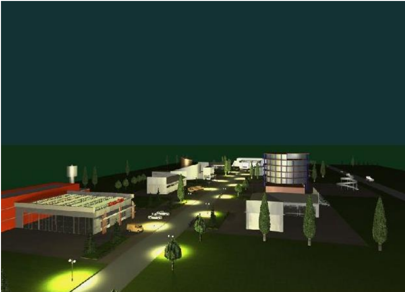
Figure 2: The Business Park in the Municipality of Drenas

Distribution of parcels will be subject to interest and scope of investors' operation. 1