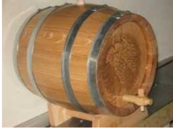
Figure 1. Barrel

The study was done at "Beha-N" Company in Rahovec which deals with the production of wooden barrels. It produces barrels of various volumes where the most common are barrels 50, 30, 20 liters (figure 1).