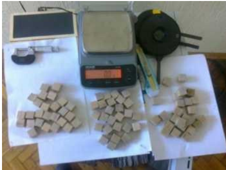
Figure 2. The view of materials and tools during practical examinations.

Then the samples were dried to oven dry moisture ( 102\pm 3^{\circ}\text{C} ). The measurements are given in chart 1.