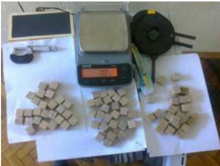
Figure 2. The view of materials and tools during practical examinations.

To calculate the specific weight, there were taken samples of 2x2x2cm and they were taken at the University of Applied Science Lab in Ferizaj. Samples were weighted on scale 0.1 gr. and measured with micrometer 0.01mm (figure 2).