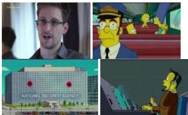
Figure No. (11) explains several cadres of the Simpsons series, at the top cadres illustrate the dialogue that the USA government monitors the telephone talks of her citizens, and below the cadres illustrate by the employee who was working on the USA National Security Agency and explains this fact

It is mentioned that the series broadcasted via Fox News, proven the truth of his expectations for the future, making some say that it's a thoughtful plan for the