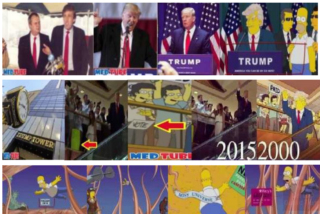
Figure No. (3) explains several cadres from one of the Simpson Family episodes in 2000 predicted that Trump becomes the president and conformed with the scene in the contemporary reality after several years when Trump was already nominated to preside the United States of America In the late 1980s, Trump was recently nominated in 2016 and the usual tray scene in the Trump Tower, and finally after he become the President of the United States and the fears about his shocking statements.

Where the father "Homer" goes to the future to find the conference "Donald Trump" and he is presenting to the USA president in the press. After The country will lose her mind . As America will fall down in the rest of the rich trump family , which control America and the the world too. There is a little who remembered this laughing and reliable episode that remembered by Sky News and broadcasted the comic episode that was given to the episode writer, a great fame since the date of Donald Trump won the presidency.