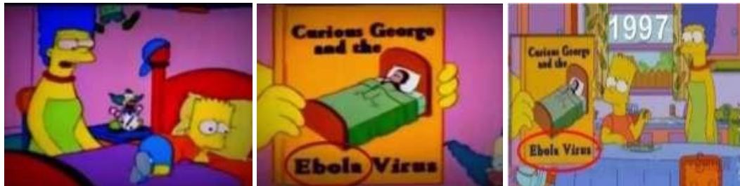
Figure No. (5) illustrates several cadres from the Simpsons series

appearance in 2014. It was almost becoming a globally disease but it remained in West Africa.