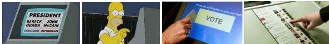
Figure No. (10) Explains several cadre from the Simpsons series

Penslvania state that all The votes that were in favor of Obama went to his first rival "Med Trump Nei".