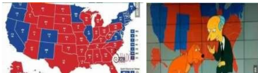
Figure No. (7) illustrates a cadre from one of the Simpsons episodes

The episode ends with Lisa's heroine the burden of the USA presidency after the failure of the trump's policy economically and also appears in another shot that Lisa friend -Mill House- - explained with a graph the unfortunate status that has been forced to take subsidies from China.