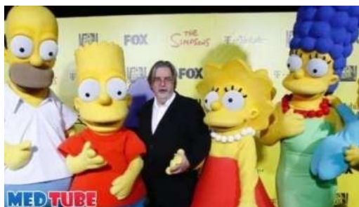
Figure No. (2) illustrates the image " Matt Groening With puppets of cartoon Simpson character,"

As for the Simpson family, ""The Samsons"called in the arabic version""omer Shamshons", "The character of "Simpson Jay Homer" and famed by" Homer" is a fake character and the hero of the animation series of the Simpson family, the series subject that Homer family-with the strange yellow to attract attention- consists of Homer,the father and his wife"marge,and three kids: Bart& lisa& Maggie. He was working in The nuclear power station "Serenfield" and Homer embodies the American moderate class. acting his voice:" Dan Castellaneta".For the first time on television, he appears with the rest of his family, in a short film entitled "Happy night" on April 19, 1987, the character of "Homer"is designed by Paintsit, "Matt Groening" while he is waiting in James L. Brokks'office hall "After its appearance for three seasons on Tracey Uliman channel, then Fox channels network get the right of publication this series to that chain and presented its first episode on 17 December 1989. Fox company has owned the official sponsor of " The Simpsons" seriesUntil year 2082.