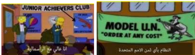
Figure No. (12) explains several cadres from the Simpsons series

Also in Hollywood movies, which merged the reality into the computer graphic and optical illusion as in the " Terminator part II", "Judgment Day", in 1991 so some videos came online and on YouTube thought that the series team workers may be Illuminati. As The series "Simpsons" on the 20th century Fox television mention some political phrases as a United Nations debate, "system with any pay "I am high with capitalism".