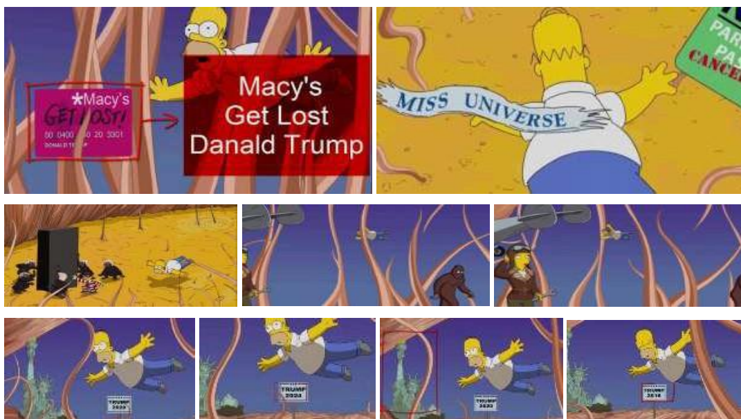
Figure No. (4) illustrates several cadres from the Simpsons series, this following years:" 2012-2016-2020-2024-2028

The fifth axis: The emergence and development of advertising animation film as a political motivate in the management of disaster and crises