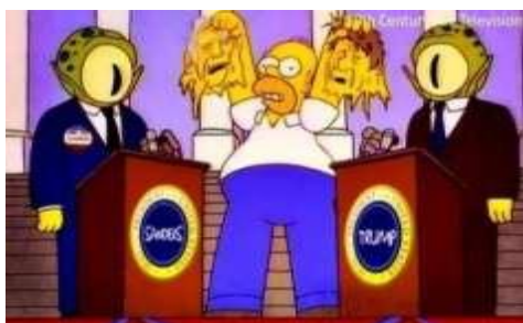
Figure No. (9) shows several cadre from the Simpsons series

The sixth axis :Expressing about American presidential elections in animation film as a political motivate