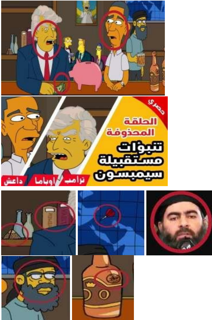
Figure NO.(13) illustrates one of the scenes expressed a lot of hidden messages from a piggy bank - symbolizes that America may need in the future for China support- to the rest of the items in the background