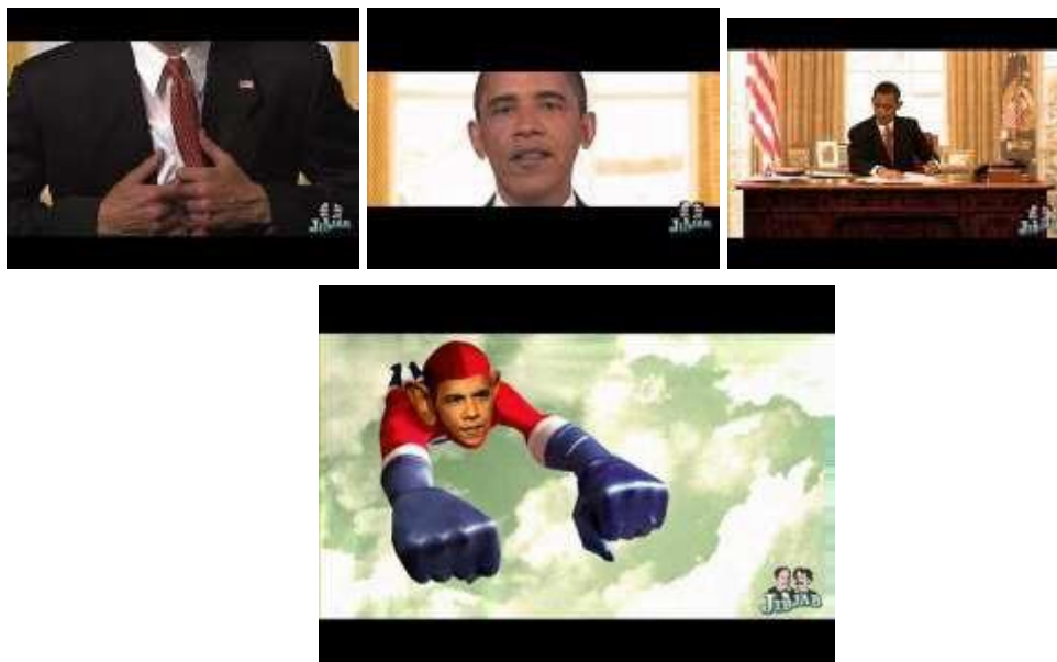
Figure No. (14) explains several cadres from Video clip entitled The Video clip lyric entitled "He's Barack Obama .. He's Come to Save the Day".

Barack Obama is the supernatural Hero as Super Man, which will achieve the impossible for America at the internal and external level in its international relations and the video clip shows the supernatural capabilities of Barack Obama.