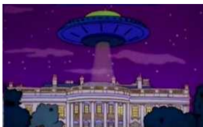
Figure No. (8) illustrates several cadre from the Simpsons series

The sixth axis :Expressing about American presidential elections in animation film as a political motivate