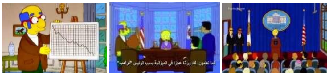
Figure No. (6) explains several cadres from one of the Simpsons episodes

In the rest of the episode, "Bart" is a failed music, while his sister Lisa was the first president of the United States - nodes here to Hillary Clinton - after the President Trump, who left the country in a bad financial position.as liza's dialogue : "We inherited a critical situation." When Lisa asked, her secretary – the president's Secretary of the United States - " Fan Hoten" for the financial situation, and he answered her : "we are bankrupt".